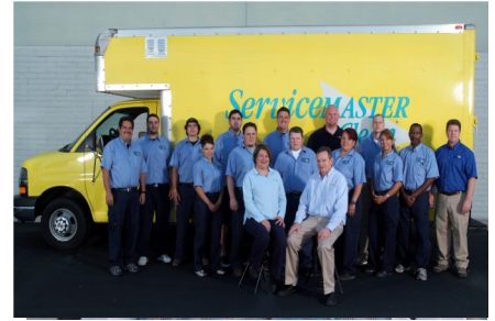
The ServiceMaster by Disaster Professionals Team

“They did a wonderful job with no disruption to our family! Thanks!”