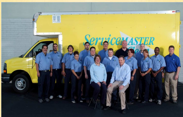
The ServiceMaster by Disaster Recovery Professionals Team